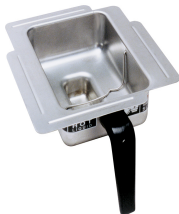
FUNNEL ASSY, SST-PP BLK HNDL Product #: 29151.0000