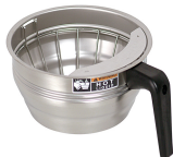
FUNNEL ASSY, SST-BLK HDL(7.12) Product #: 20216.0000