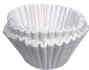
FILTERS,REGULAR1M 500/2 50/CL Product #: 20115.0000