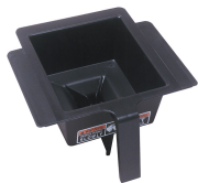
FUNNEL W/DECAL,PPK NAR BLK(SM) Product #: 02774.0011