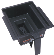
FUNNEL W/DECAL,PPK NAR BLK(LG) Product #: 04274.0012